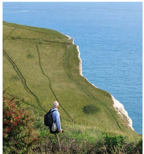
Langdon Bay Cliffs offer an excellent viewpoint.

On the far side of the lighthouse turn left down a short path which leads into a lane, turn right along the lane, walk approximately 20 metres and take the gate on your right, into a field. Follow the cliff path to its end and turn left into another lane which leads to the lovely village of St Margaret's-at-Cliffe. Where the path enters the village, you will find the Pines Garden, Tearoom and Museum ❺.