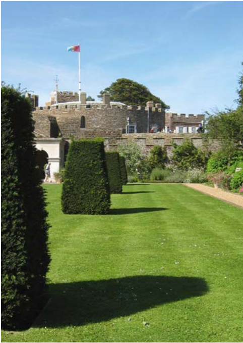
Eight acres of award-winning gardens await at Walmer Castle.

Go down to the bay 6 and pick out the white house with green shutters. This was the James Bond author Ian Fleming's former holiday home, White Cliffs, which he bought in 1952 from his friend, Noel Coward.