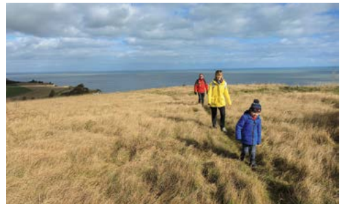
The cliff tops at St Margaret's-at-Cliffe offer beautiful views.

The walk ends at Deal Pier 12 , which is clearly visible to the right. The pier is the same length as the Titanic and at the end there is a wonderful café with incredible Channel views and a very well-earned cuppa. Be sure to visit The History Project which offers historic walking tours of Deal on Saturdays and Sundays throughout the summer from their yellow tent on Deal seafront, across from Deal Beach Parlour. Tours cover all aspects of the town's history from Caesar's invasions to the modern day.